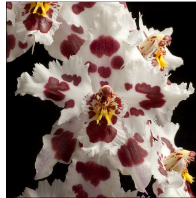
Odm. Pesky Nicky '#1' AM/AOS

West Shore Orchid Society held its orchid show in Strongsville, Ohio, the weekend following the GAOS show. Greater Akron Orchid Society entered a display and was awarded a Red ribbon for its efforts. Many Blue, Red and Yellow ribbons were received. Jackie Muster's Oncidium peltiforme captured a Best in Class trophy.