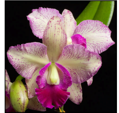
Lc Christian Starr 'Aloha' HCC/AOS