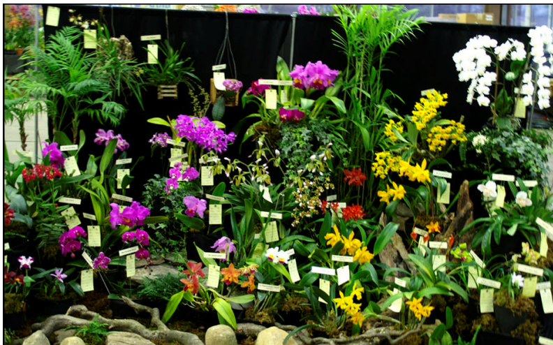
2011 GAOS Spring Show Display

Greater Cleveland Orchid Society, Central Ohio Orchid Society, West Shore Orchid Society and GAOS all entered displays of orchids, arranged for effect, joined by vendors, New Vision Orchids, Roberts Flower Supply, Porters Orchids, Natts Orchids and Windswept in Time Orchids. Judges, certified by the American Orchid Society, evaluated the displays and the plants in them. They awarded numerous Blue, Red, and White ribbons to plants and orchid-related art in 108 classes.