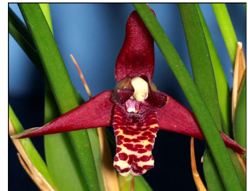
Maxillaria tenuifolia – Bernadette Skalak