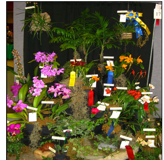
GAOS Display at WSOS Show

West Shore Orchid Society held its orchid show in Strongsville, Ohio, the weekend following the GAOS show. Greater Akron Orchid Society entered a display and was awarded a Red ribbon for its efforts. Many Blue, Red and Yellow ribbons were received. Jackie Muster's Oncidium peltiforme captured a Best in Class trophy.