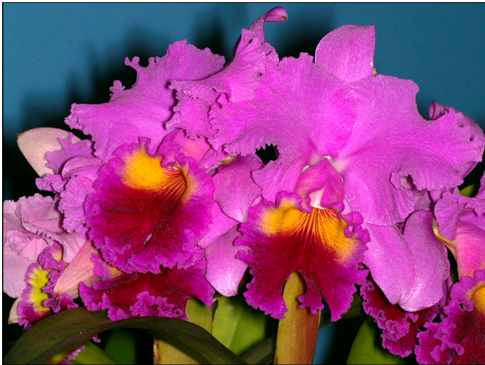
Lc Drumbeat 'Heritage' AM/AOS – Frank Skalak