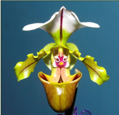
Paphiopedilum spicerianum