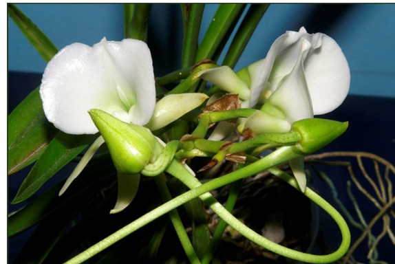
Angraecum longiscott '00'