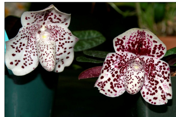
Paphiopedilum Conco-Bellatulum & Paphiopedilum bellatulum – Bret Winkler