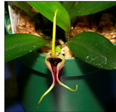
Masdevallia discoidea