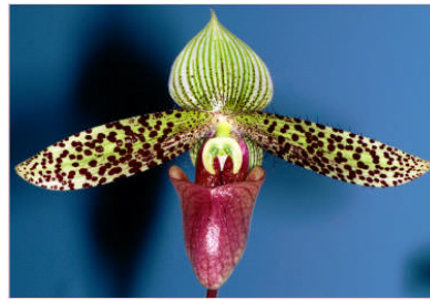
Paphiopedilum sukhakulli 'Windsong's Buzz' HCC/AOS – Bret Winkler