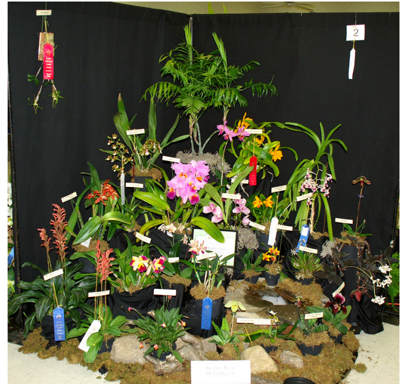
GAOS Display at the GCOS Show

West Shore Orchid Society will hold its spring show on March 12-13, 2011 at the Strongsville Recreation Center, Strongsville, OH. Setup will be on March 11.