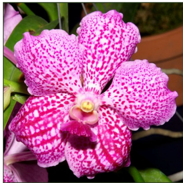
Vanda Thammalak – Mary Bell

Bulbophyllum frostii Phalaenopsis cornu-cervi