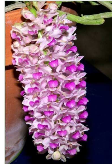
Rhynchostylis retusa