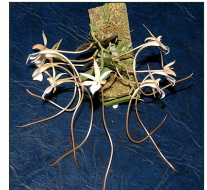
Aerangis punctata