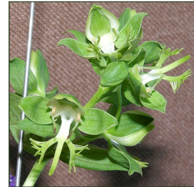
Habenaria davidii