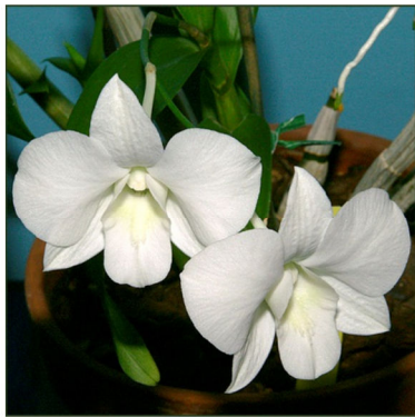
Dendrobium Snow White – Barb Sponseller