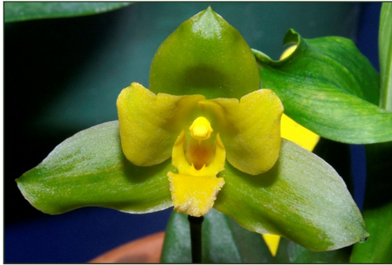
Lycaste suaveolens