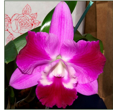
Lc Mini Song 'Petite' AM/AOS – Jackie Land